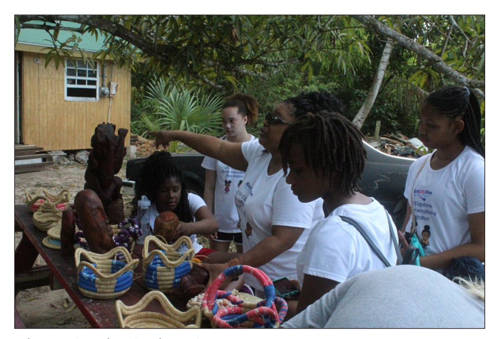
Figure 7: Basket weaving educational experience.

Cohort 2 attended lectures on herpetology, invasive species, fish identification, and oceanic versus freshwater blue holes. Here, they were taught by marine scientists of Forfar Field Station. Instruction took place both in the classroom and on location. For instance, in learning about the differences between freshwater and oceanic blue holes, the girls visited an oceanic blue hole and Captain Bill's Blue Hole. Captain Bill's Blue hole is a freshwater blue hole and the largest blue hole on the island, measuring 440 feet across and included an exhilarating 15 foot jump into the water, which the girls enjoyed (See Figures 8 and 9 ). Thereafter, they visited an oceanic blue hole. In both locations, participants conducted water sample testing that included measuring salinity, pH, and water temperature at various depths of each blue hole.