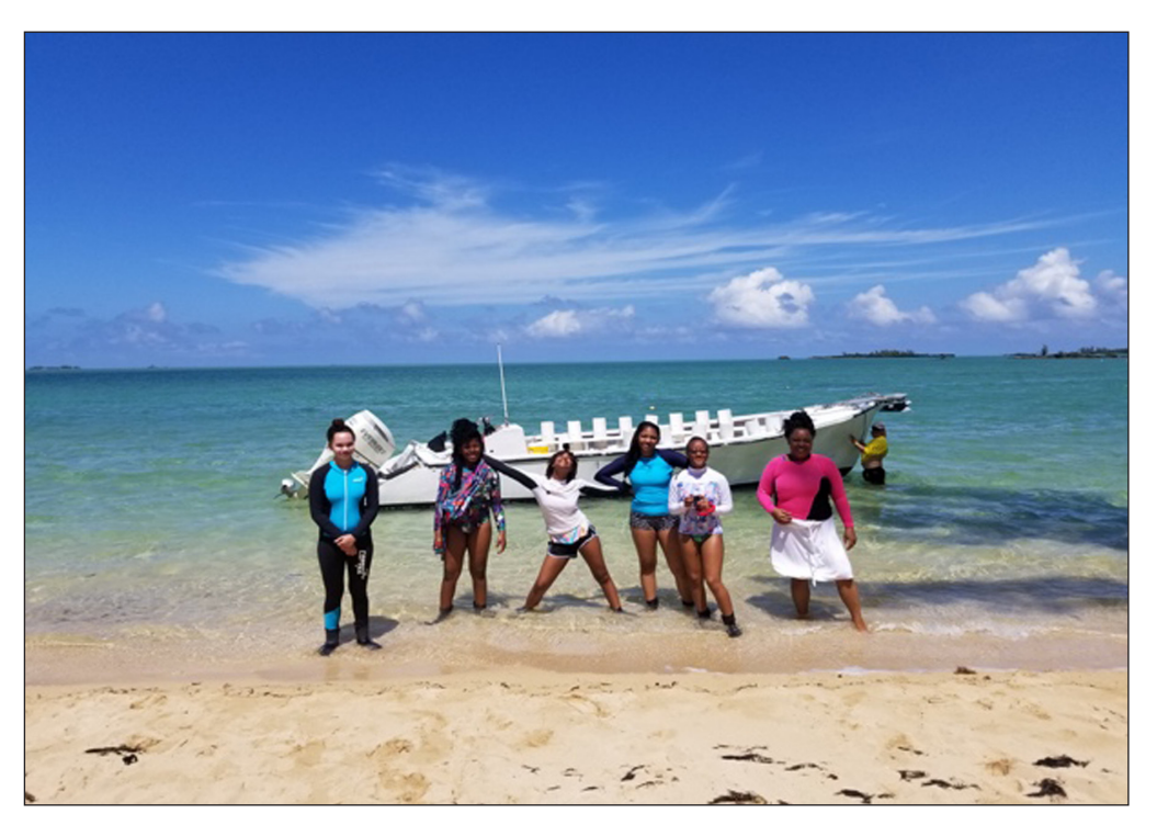
Figure 4: Preparing for boat diving.

Participants had the opportunity to visit locations on the island where people come to purchase wood carvings and baskets. Much to their surprise, the work of these craftsmen occurred in their private homes. As a result, the girls not only had the opportunity to listen and explore the workmanship but were able to get a perspective on how people on the island lived (See Figure 7 ).