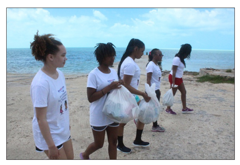
Figure 10: Beach Clean Up.

The girls selected A-Flats as the dive site of their first certified dive (See Figure 12 ). This site is located slightly south of Forfar International Field Station near Pigeon Cay. It has a sandy bottom and is around 20 to 30 feet deep. At this site, there is a stunning variety of corals, fish, and invertebrates. During their dives, they observed sting rays, a shark, and schools of fish of many varieties.