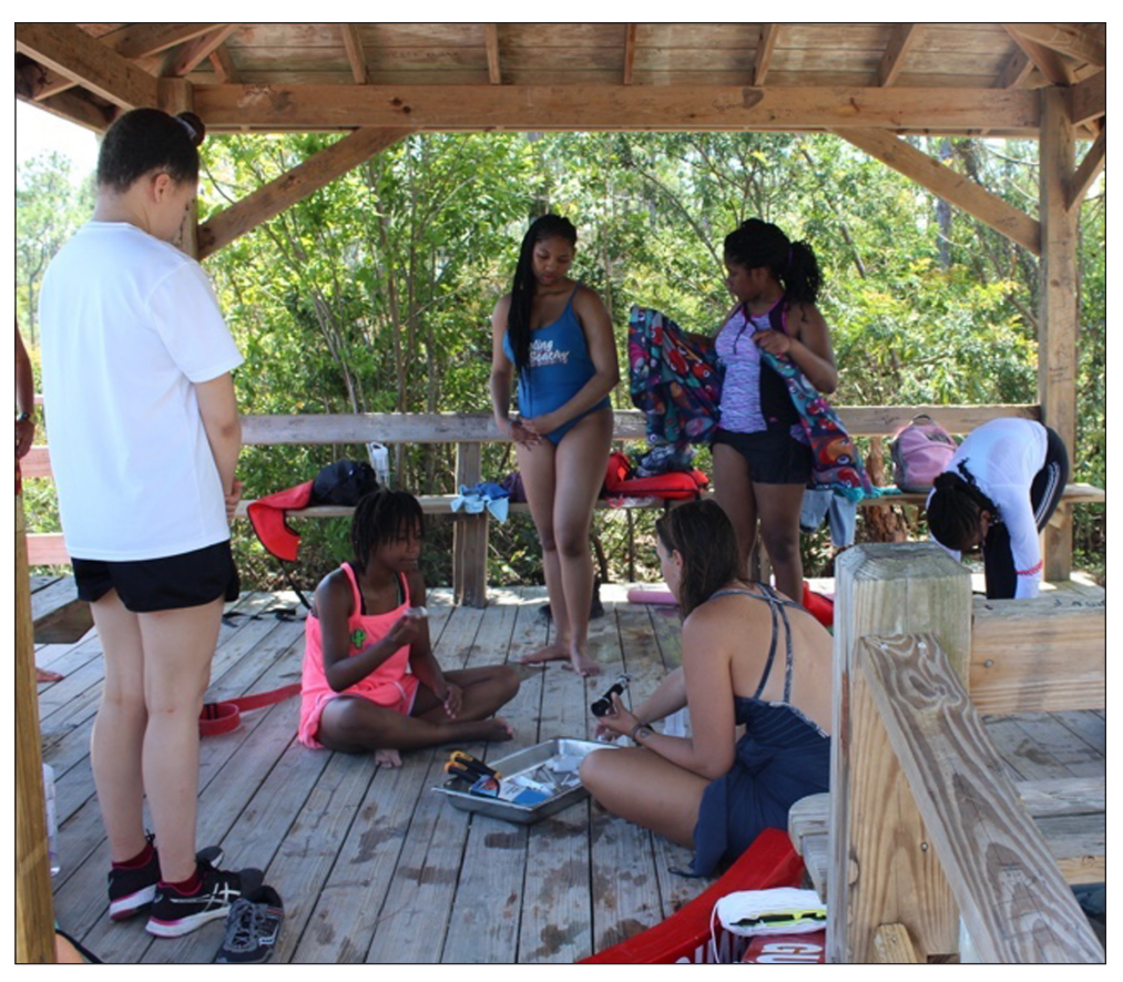
Figure 8: Blue holes lecture at Captain Bill's Blue Hole.