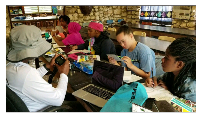
Figure 11: Dive Planning.