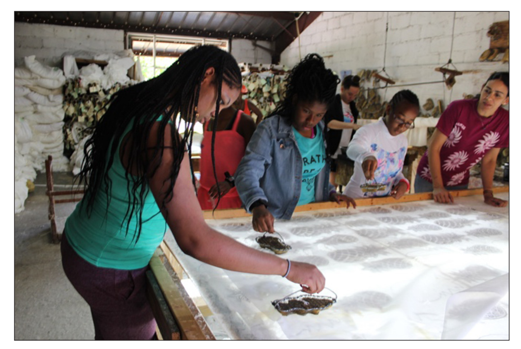
Figure 5: Batiking at Androsia Factory lecture.