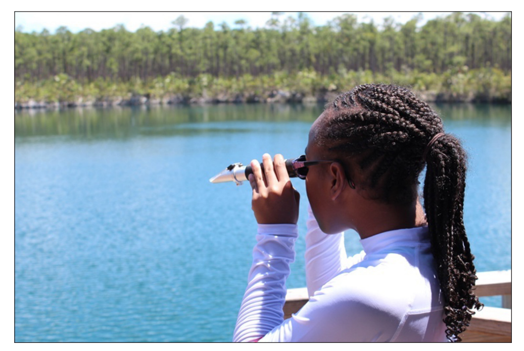
Figure 9: Oceanic versus freshwater blue holes lab.

With a year's worth of confined pool diving to hone their SCUBA diving skills, the girls completed their open water checkout dives on Andros Island and became certified Professional Association of Diving Instructors (PADI) open-water divers. They meticulously engaged in multi-dive planning, selecting and learning about the location of their dives, planning their diving depths and calculating surface intervals (See Figure 11 ).