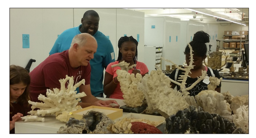
Figure 14: Lecture with invertebrate specialist at the Museum of Natural History.