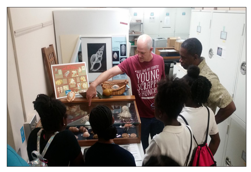
Figure 13: Lecture: Coral Types at Museum of Natural History.