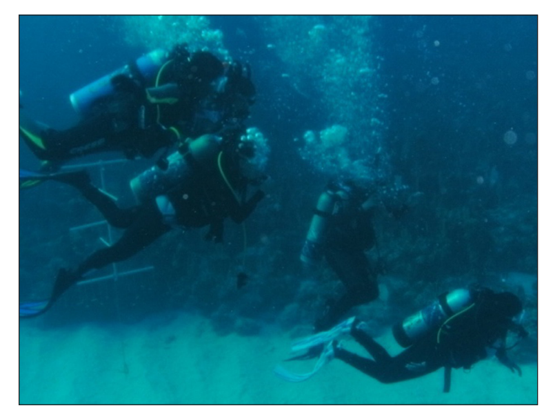
Figure 12: First dive as certified divers at A-Flats dive site.