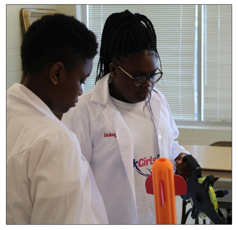
Figure 1: Lecture: Coordinate system review.

In the STREAMS program, participants learn ocean science, principles of mechanical and electrical engineering, coordinate systems, and project management to design, fabricate, build (See Figures 1 and 2 ), and operate underwater remote operated vehicles with recording capabilities (ROVR). They take classes in underwater photography, learn how to SCUBA dive, and learn about the principles of scientific diving.